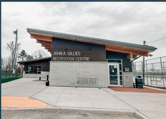
138 Sarah St. E Braeside