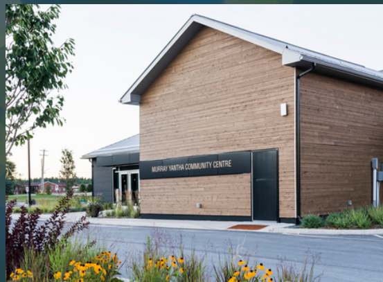
2473 Russett Dr. Arnprior