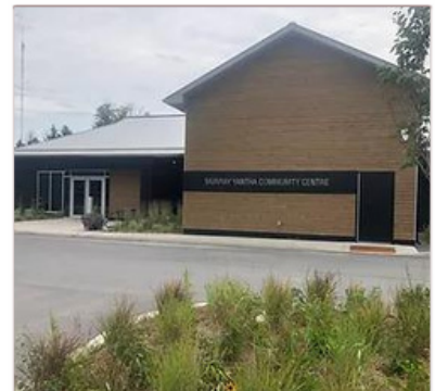
MURRAY YANTHA COMMUNITY CENTRE