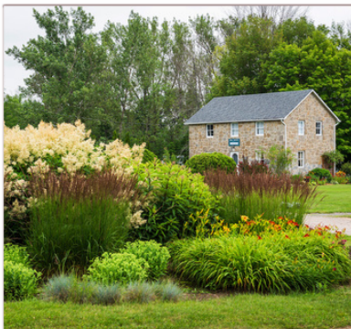
WABA COTTAGE MUSEUM & GARDENS