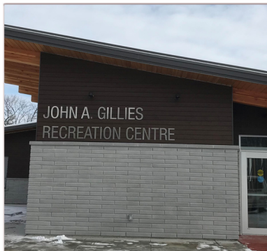
JOHN A. GILLIES RECREATION CENTRE