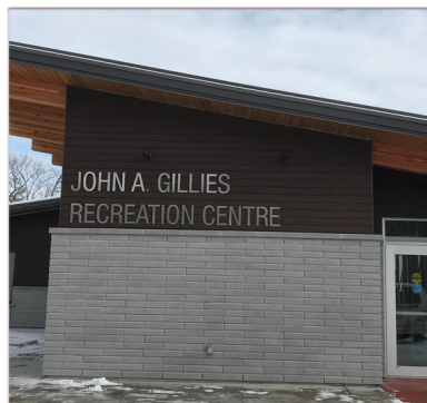
JOHN A. GILLIES RECREATION CENTRE