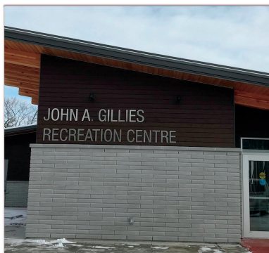
JOHN A. GILLIES RECREATION CENTRE