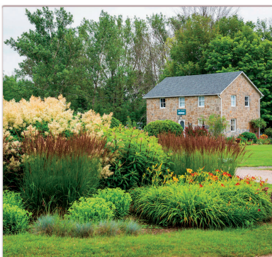
WABA COTTAGE MUSEUM & GARDENS