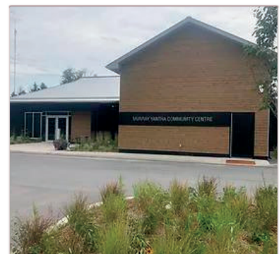
MURRAY YANTHA COMMUNITY CENTRE