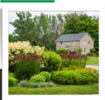
WABA COTTAGE MUSEUM & GARDENS