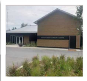
MURRAY YANTHA COMMUNITY CENTRE