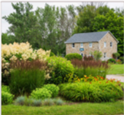
WABA COTTAGE MUSEUM & GARDENS