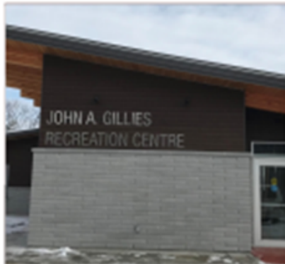
JOHN A. GILLIES RECREATION CENTRE