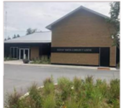
MURRAY YANTHA COMMUNITY CENTRE