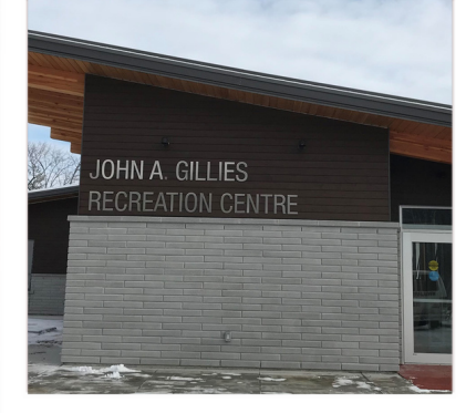
JOHN A. GILLIES RECREATION CENTRE