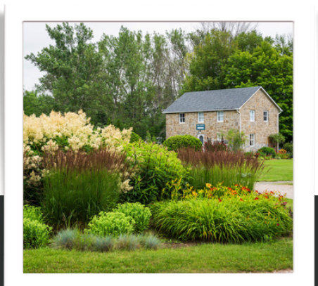
WABA COTTAGE MUSEUM & GARDENS