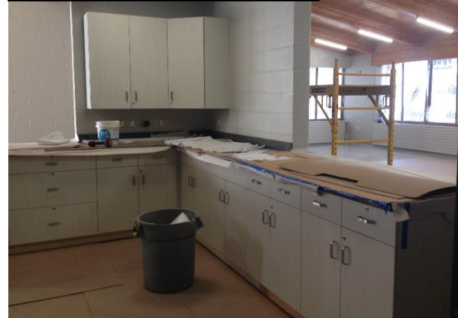
John A. Gilles Rec Centre: Hall